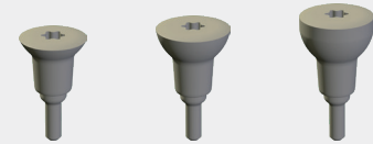
Z5s-G10, Z5s-G20, Z5s-G30