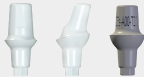
Z5s-A00-G10, Z5s-A15-G10m, Z5s-A00-T20