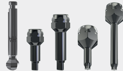
Z5s-HA*, Z5s-RA12 incl. screw, Z5s-RA16 incl. screw, Z5s-SD-T6, Z5s-SD-T6-L

* Their application requires previous experience with manual insertion instruments.