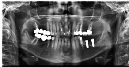
Fig. 2: panoramic x-ray after surgery

The clinical situation after primary wound closure can be seen in figure 3.