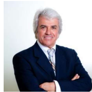
Dr. Jean Louis ROCHE Implantologie Dentaire Saint Laurent du Var - France www.dr-roche.fr

The lower left first and second molars of a 54 years old female patient were replaced with two new two-piece ceramic implants and restored with splinted crowns. The implants (diameter: 4 mm, length: 10 mm) were placed 12 weeks after extraction (Nov. 23, 2012) with a classical flap elevation procedure without adjunct bone augmentation. Figure 1 and 2 show panoramic x-rays before and after implant surgery.