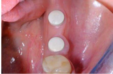
Fig. 4: clinical evaluation 16 weeks after surgery

The soft tissue's response around the zirconia implants is great, without any signs of inflammation. The height of the abutments had to be reduced (see figure 5) to let enough space for the future prosthetic restoration.