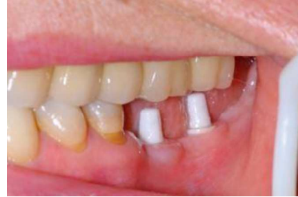
Fig. 5: abutment placement

After impression taking the patient was restored with two splinted ceramic crowns. Ten months later (Jan. 10, 2014), the patient was seen for a follow-up examination. Healing was uneventful and gingival health as well as crestal bone level maintenance are very good (see figures 6 and 7).