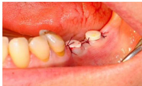
Fig. 3: clinical evaluation after suturing

The clinical situation after primary wound closure can be seen in figure 3.