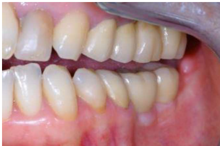
Fig. 6: clinical evaluation with final restoration in place

After impression taking the patient was restored with two splinted ceramic crowns. Ten months later (Jan. 10, 2014), the patient was seen for a follow-up examination. Healing was uneventful and gingival health as well as crestal bone level maintenance are very good (see figures 6 and 7).